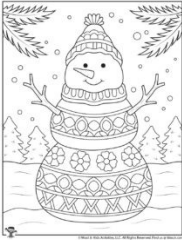
Find us on @mind.com